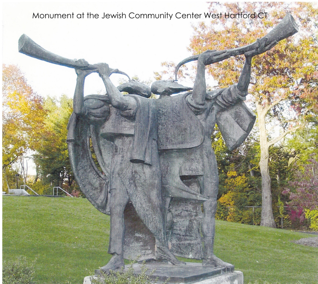
Monument at the Jewish Community Center West Hartford CT