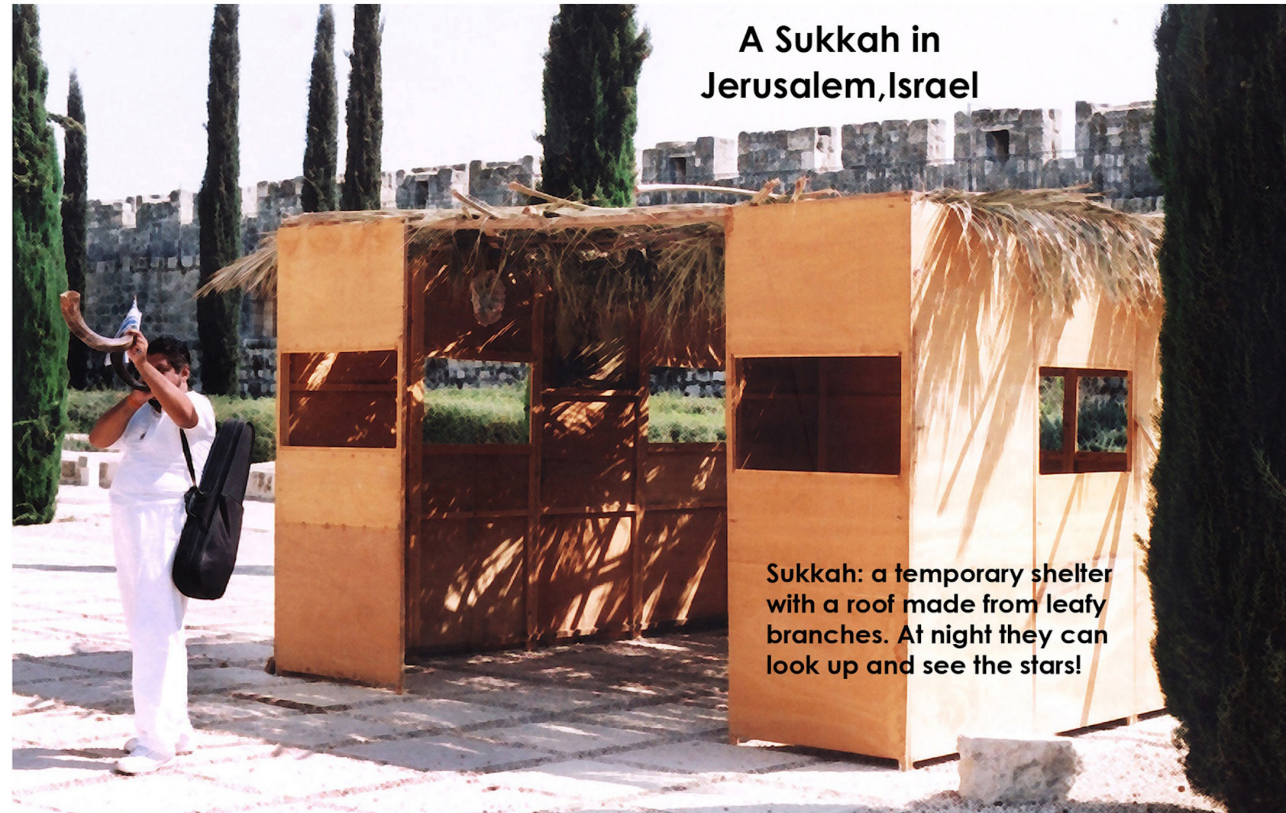
A Sukkah in Jerusalem, Israel

Sukkah: a temporary shelter with a roof made from leafy branches. At night they can look up and see the stars!